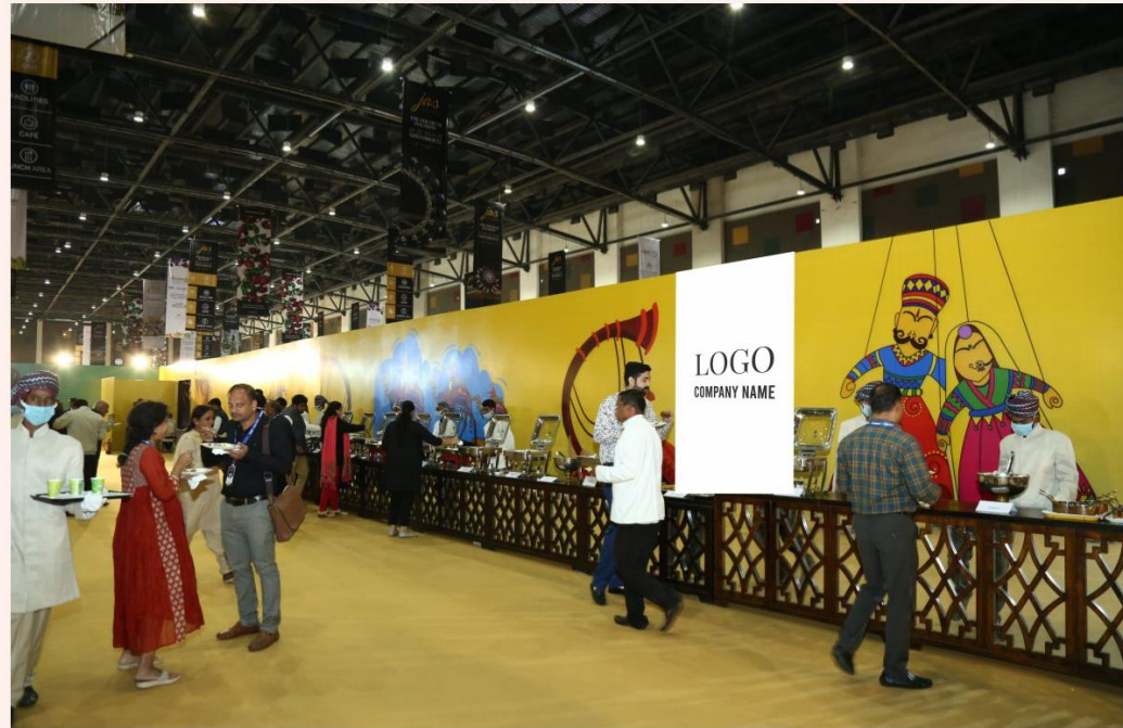
Lunch Area Branding