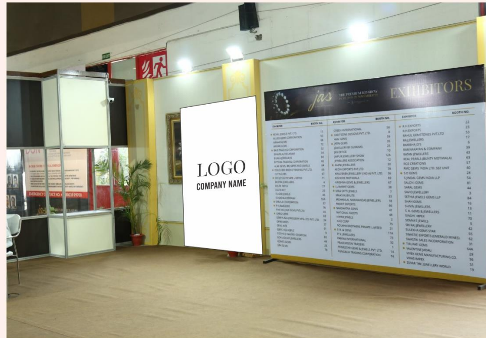
Exhibitor list side branding