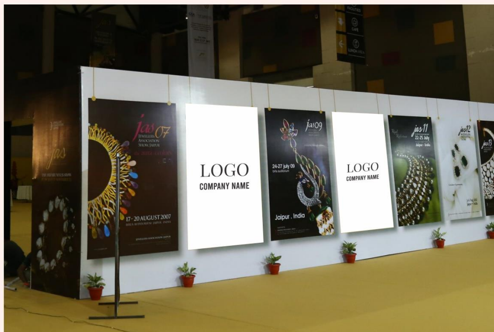
Outer Lunch Area